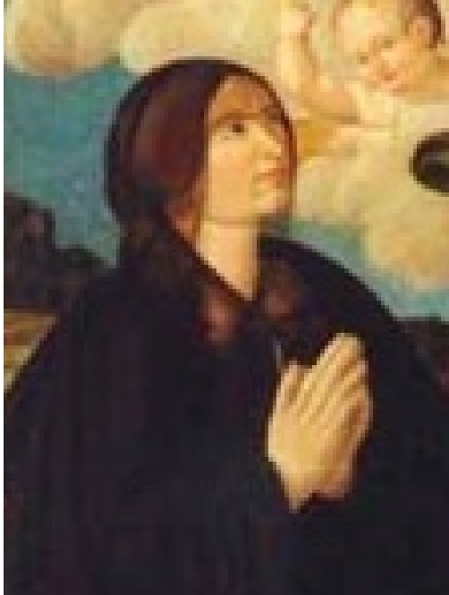
An image of Costanza d'Avalos from a fresco in a Neapolitan church

One of the joys of writing historical fiction is that it is fiction . I could take that nugget of supposition proposed by art historians and imagine an encounter that produced a portrait that has enthralled the world for centuries.